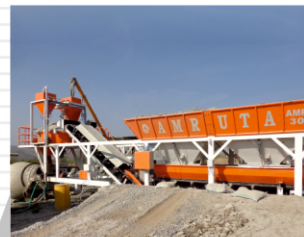
MOBILE BATCHING PLANT Capacity 20,30 M3/Hr