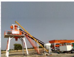
STATIONARY BATCHING PLANT Capacity 20 To 120 M3/Hr