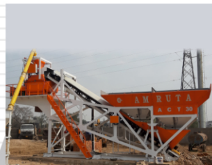
COMPACT BATCHING PLANT Capacity 20 To 120 M3/Hr