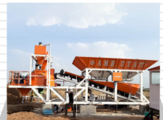
NANO MOBILE BATCHING PLANT Capacity 20,24 M3/Hr