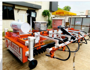
FIX FORM PAVER