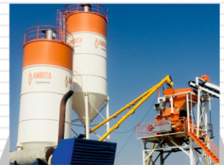
SILo & ACCESSORIES